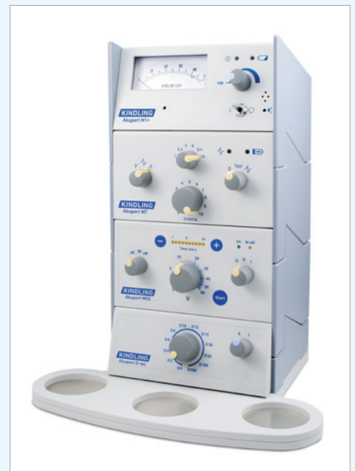
Akuport-Tower complemented with Akuport D-tec