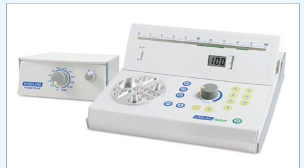
Akuport D-tec + Vistron