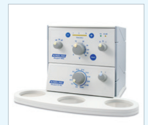
Akuport D-tec + Akuport MR2