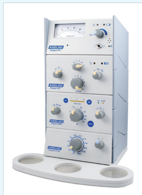
Akuport-Tower complemented with Akuport D-tec