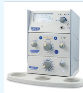
Akuport D-tec + Retec-Tower